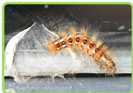
This caterpillar has taken ten days cocoon building so far.