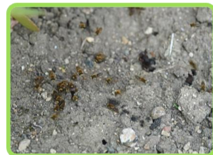
Ground bees digging holes ready to lay their eggs

A couple of weeks ago a neighbour called me over to ask me for advice as bees were making it difficult for him to work on his garden. They turned out to be ground bees. Although these mining bees are solitary they often congregate in the same area, especially if the ground is suitable for them. Ground bees as the name suggests is a generic term for a group of bees that build nests in the ground. Of the 267 types of bees in the UK 70 fall into this category. Similar in size to a worker honeybee, ground bees differ in that they don't build large social nests. The males mate with individual females, whereas with honeybees, the male only mates with the queen. Though in both types of bee the male dies soon after mating. The female, like her honeybee counterpart, does all the work.