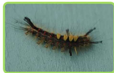
Far from its usual patch a Scarce Vapourer

Volunteer at Houghton Hall Park and Gardens