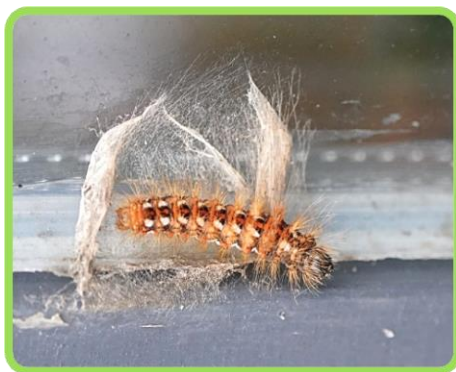
Little progress after a further week

Having mated the female will prepare a nest, digging a hole a few inches deep in the soil where she will lay a single egg. She then collects and deposits pollen as food for the larvae when the egg hatches. This process she will repeat for six or so weeks until she dies. The emerging bees then emerge and continues the cycle. Like honeybees, some overwinter in the soil only emerging in the spring as the weather warms up. Whilst bees can survive the cold, the temperature needs to be around 15 degrees before they can fly. If left alone ground bees are mild mannered and with no nest to defend unlikely to sting. They make a valuable contribution to the eco system in several ways. Like other bees they are excellent pollinators, particularly for early plants in the spring. Because they aren't generalist feeders, they pollinate a wide range of fruit, flower, vegetable plants and trees. Their digging habit also aerates the soil allowing water and nutrients to penetrate deeper into the ground. Their preference is for dryish light soil with little or no vegetation. So, the easiest way to deal with them if they do become a nuisance, is to mulch the ground and grow ground cover plants. This will persuade them to move on, as trying to eradicate large numbers, as in my neighbour's case, will prove difficult.