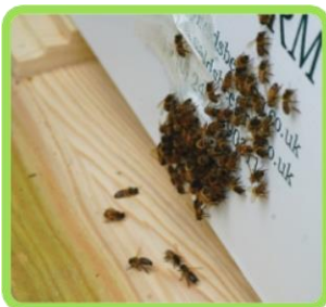
The new bees starting to explore.

After a couple of hours, I put the hive on the stand and transferred the five frames from the box to the hive. The bees that were still flying, happily came back accepting the hive as their new home. I will leave them now for a week to settle before disturbing them anymore.