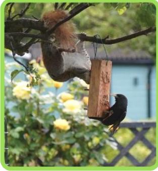
A squirrel and starling sharing my homemade bird feeder.

The recent warm weather has certainly brought all sorts of wildlife out. All sorts of bugs are making the most of the sunshine. I saw a damselfly warming itself on a rhododendron flower a few days ago. Ladybirds and butterflies too have been more abundant. As are box caterpillars an insect which is also a serious pest is the box caterpillar. The moth Cydalima perspectalis lays her eggs on the underside of box trees and the emerging caterpillars lay waste to the host plant at an alarming rate. They protect themselves by creating a dense layer of white webbing stretched over their feeding ground. This East Asian native, first arrived in this country in 2007 and has since gained a firm foothold. After a month the caterpillars pupate, and the emerging moth quickly