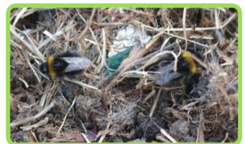
Bees enjoying the early morning sunshine.