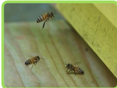
Bees returning to the hive from their first foraging trip.