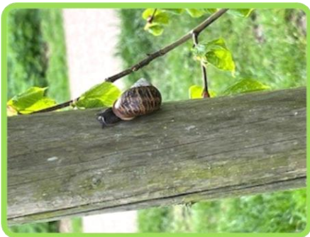
By Myles Pessoa