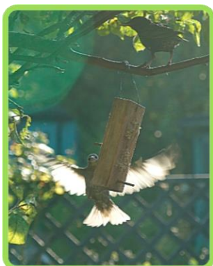
A Starling Angel

Despite the recent weather indicating otherwise, it's officially summer and nature is in full swing. Wildlife