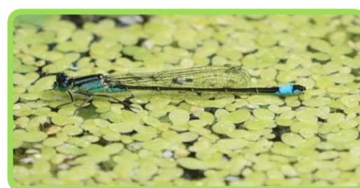
A Blue Tailed Damselfly