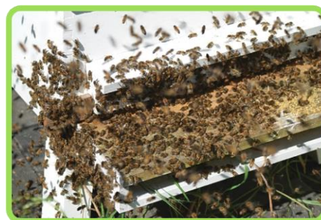
Bees start moving into a hive.