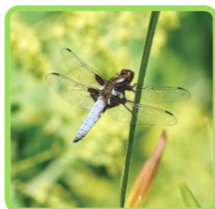
A Broad Bodied Chaser

As Dragonflies and Damselflies have been about in great numbers recently, I thought they should be the main topic of this month's article.