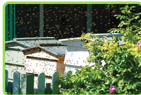
The bee swarm arriving, the noise was incredible

Dragonflies start their lives in water. Females lay their eggs in or near water, and these hatch into aquatic larvae known as nymphs, which are quite ugly and nothing like the beautiful insects they will eventually become. At this stage of their development, they live underwater, preying on tadpoles, small fish, and other aquatic insects. They have extendable jaws that can shoot out to catch prey with