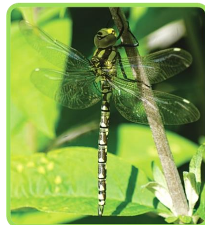
Southern Hawker, the eyes forming a large part of its head.

Dragonflies are essential to their ecosystems. As nymphs, they help control populations of aquatic pests. As adults, they eat vast quantities of insects, including mosquitoes, helping to keep these populations in check. Dragonflies themselves are prey for birds, frogs, and larger insects, making them key players in the food chain. They are also indicators of environmental health. Because they are sensitive to changes in water quality, a healthy dragonfly population often means clean, unpolluted water. Despite their resilience, dragonflies face threats from habitat loss, pollution, and climate change. Wetland drainage and water pollution reduce the habitats available for their nymphs to thrive. Conservation efforts focus on protecting wetlands and ensuring clean waterways. Raising public awareness about the importance of dragonflies can also help support conservation initiatives. By protecting their habitats and recognizing their importance, we can ensure that these amazing creatures continue to thrive in our skies for generations to come.