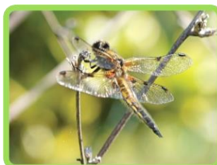
Four Spot Chaser

They are some of the most ancient insects which have been around for over 300 million years. Along with their close relatives' damselflies, Dragonflies belong to the order Odonata and play an important role in nature. Fossilized specimens show that some early dragonflies had wind spans of around 2 feet (60cm.), which would have looked spectacular. Even though modern dragonflies are more modest in size, they are still impressive with their amazing colours.